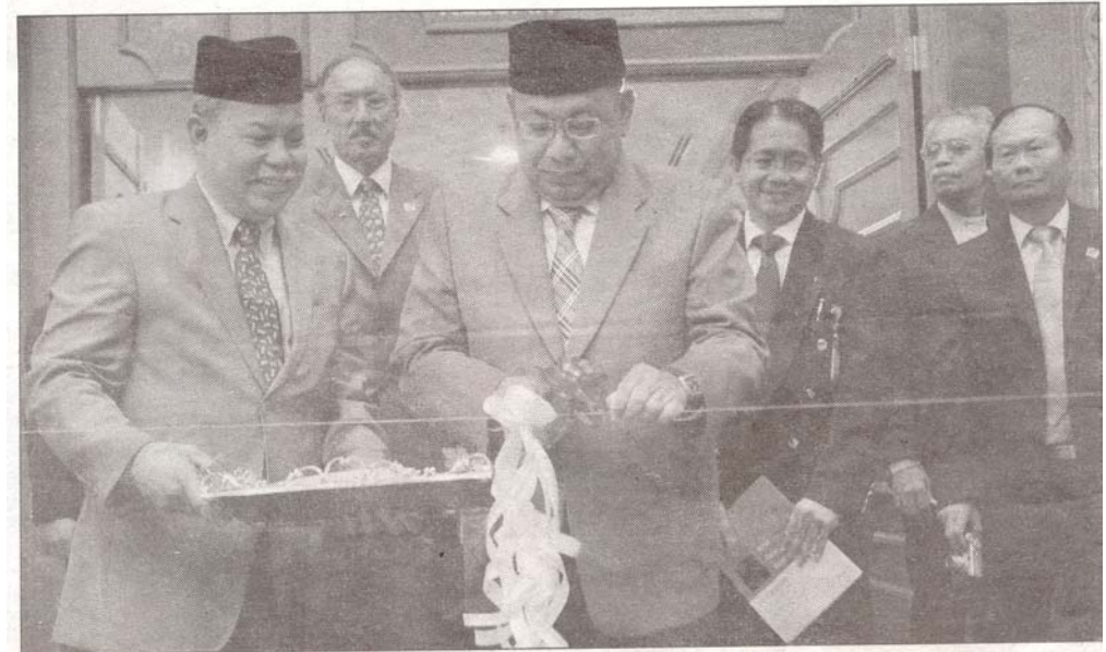
The guest of honour cutting the ribbon to launch the exhibition

The Minister of Development then officiated the SEASC2005 exhibition by cutting the ribbon and proceeded to tour the exhibition booths.