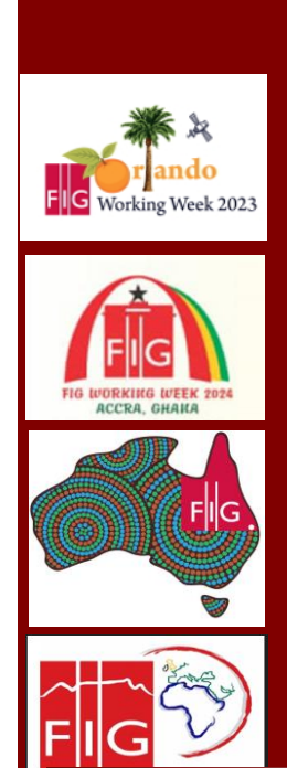
FIG Working Weeks-Build on Pillars