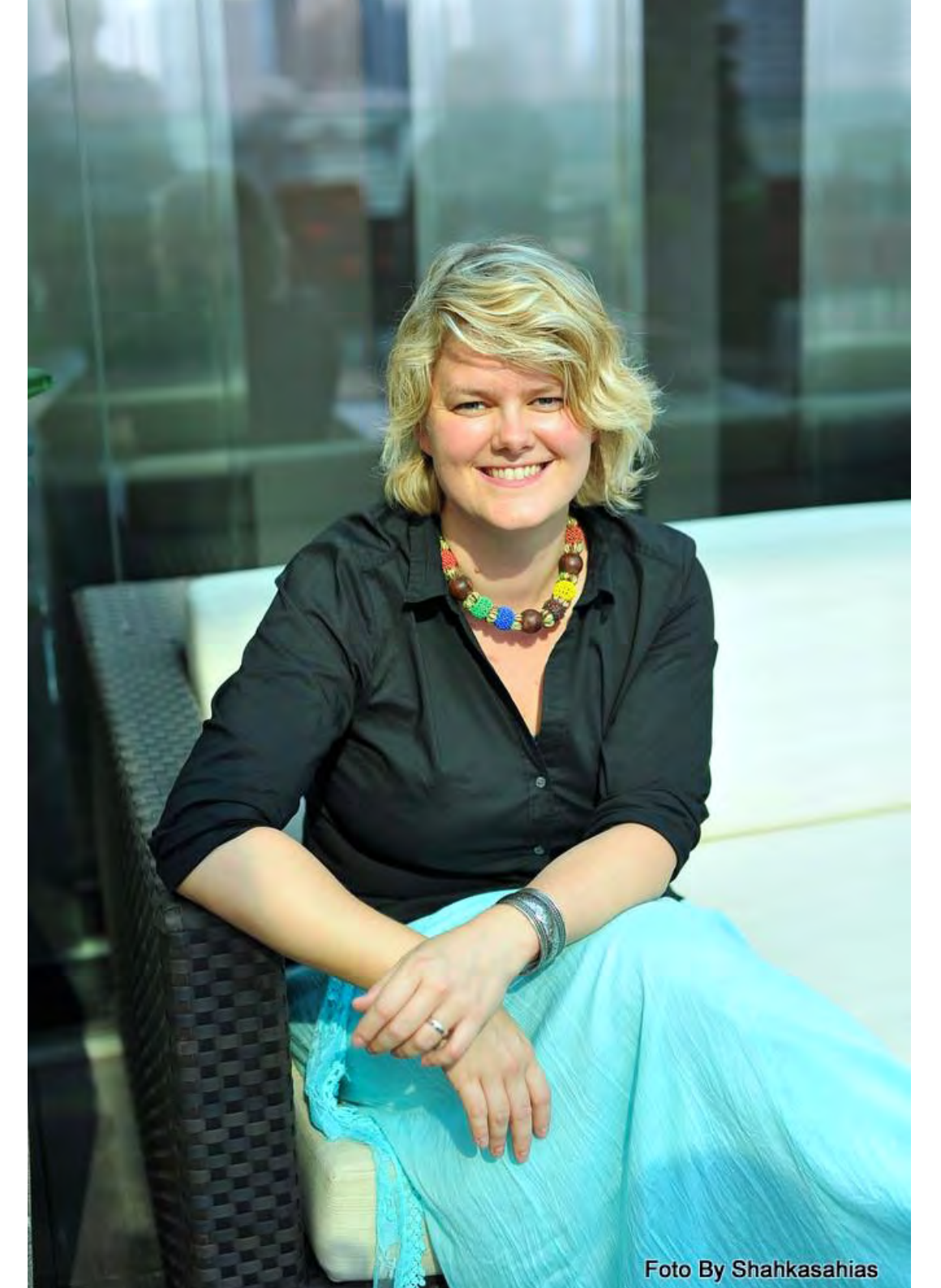
FIG Young Surveyors Network Vice-Chair of Administration