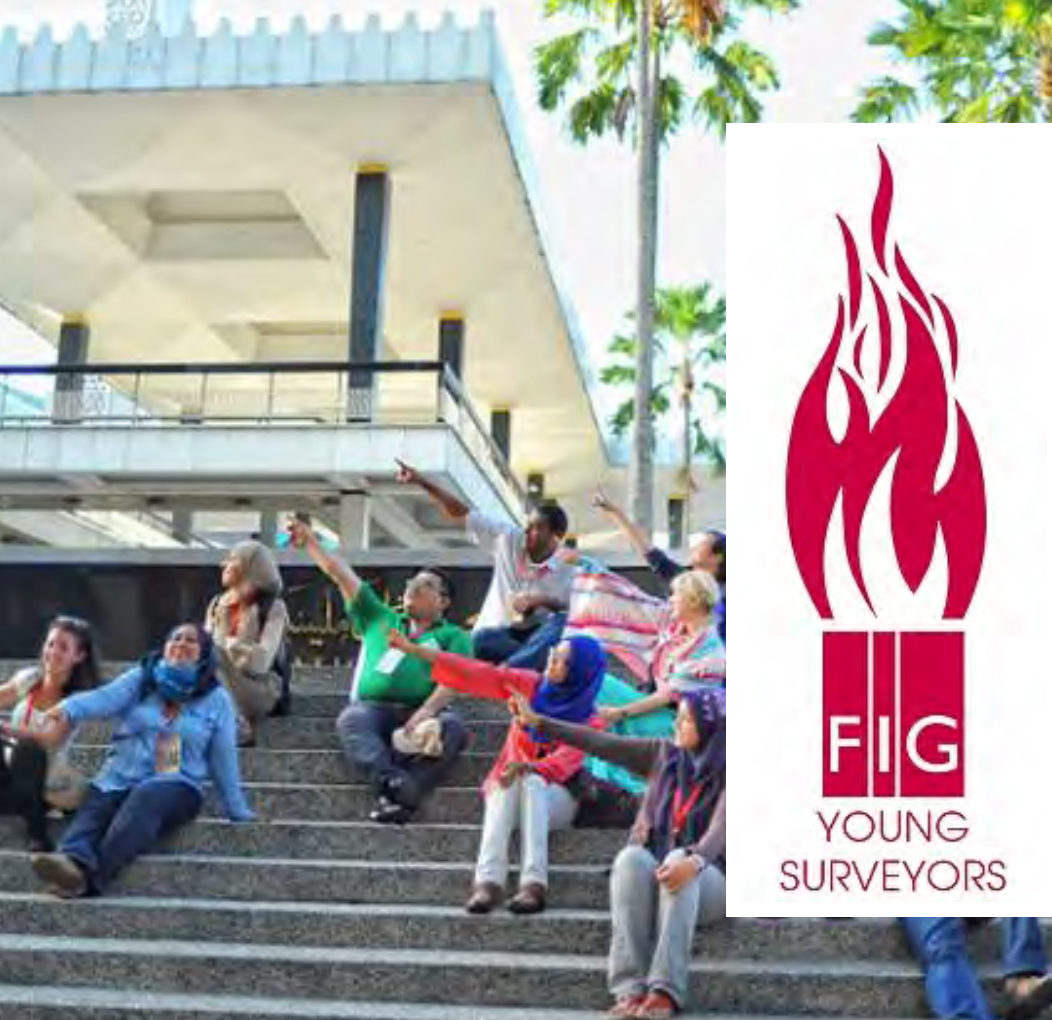
FIG YOUNG SURVEYORS ASIA PACIFIC NETWORK