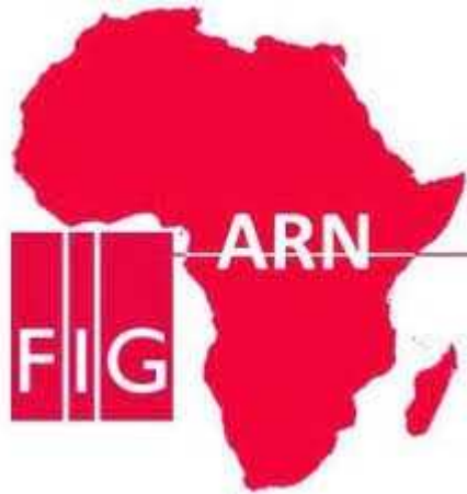
FIG-ARN and the AU Agenda 2063

Your World, Our World: Resilient Environment and Sustainable Resource Management for All