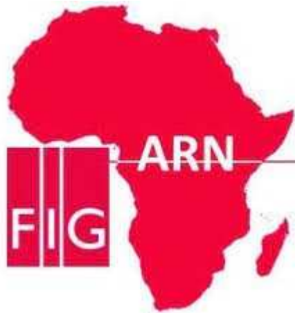
FIG ARN and the 31 st International Cartographic Conference Cape Town ICC South Africa 13-18 August 2023: Smart Cartography for Sustainable Development

Your World, Our World: Resilient Environment and Sustainable Resource Management for All