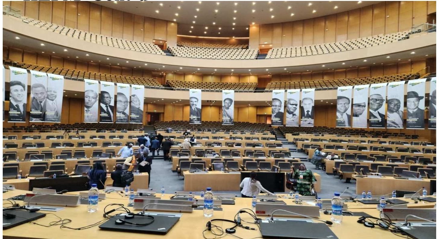
FIG-ARN FHLFM Presidents of African land professional associations –Mandela Hall AUC Hqs.