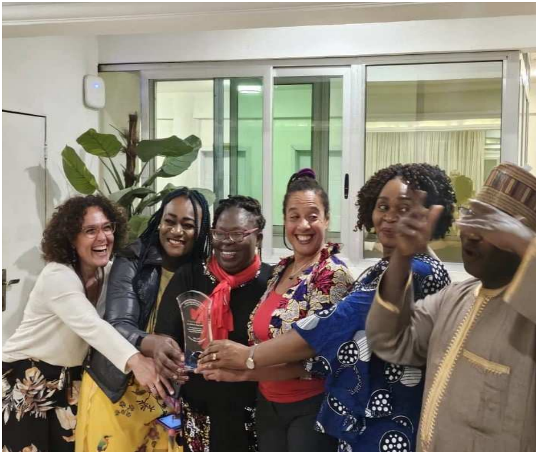
FIG-ARN Held a Network Dinner

Network Dinner was supported by Leica and Topcon