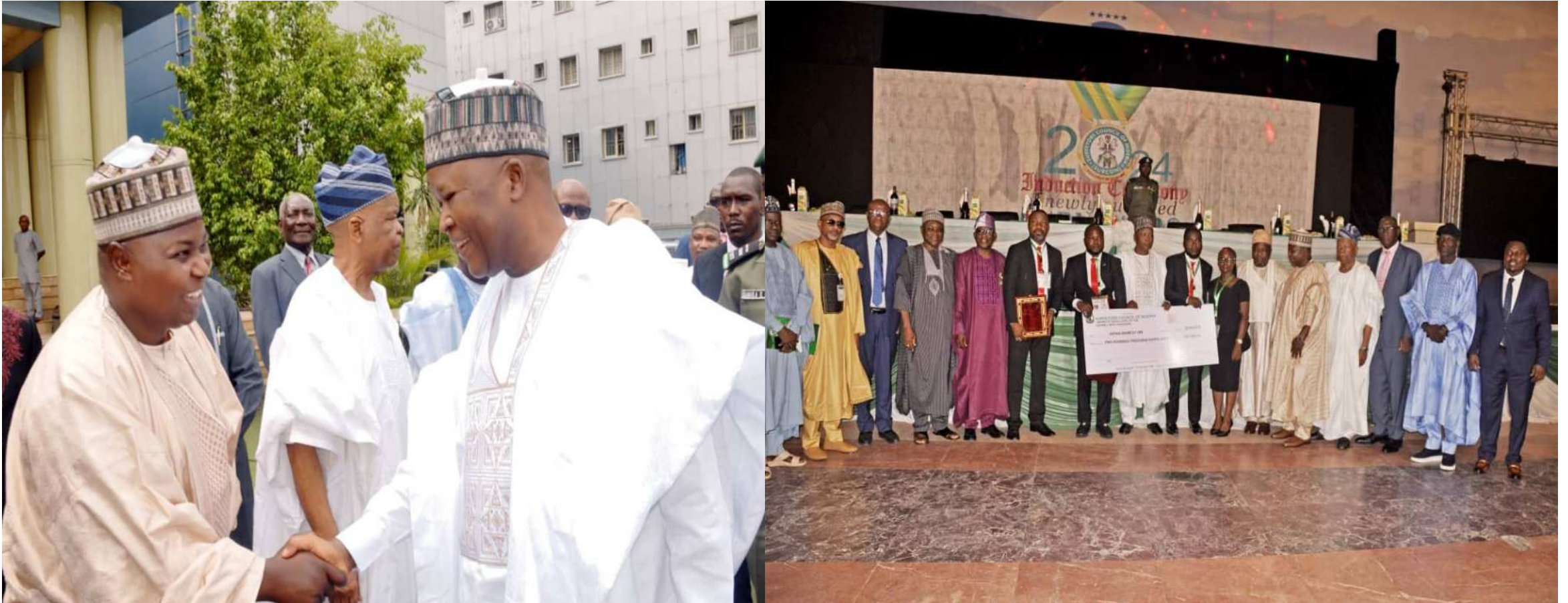
A group photo with the Minister, top officials of government, well-wishers, and the award winners