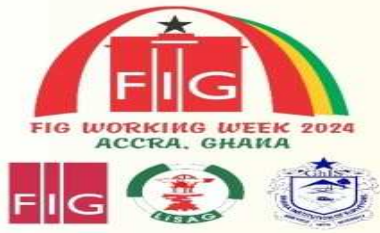
FIG Working Week 2024 19-24 May Accra, Ghana

Your World, Our World: Resilient Environment and Sustainable Resource Management for All