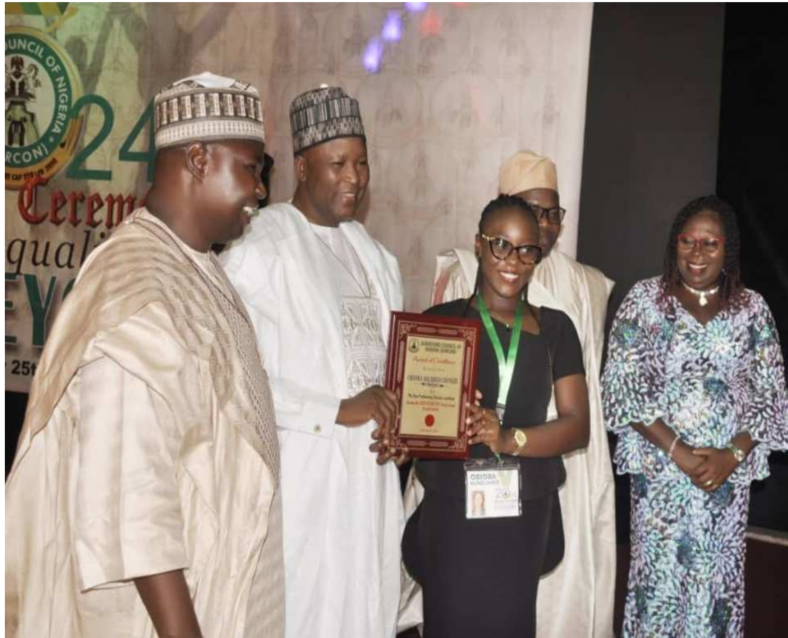
FIG-ARN Honored Best Female Inductee Surveyor