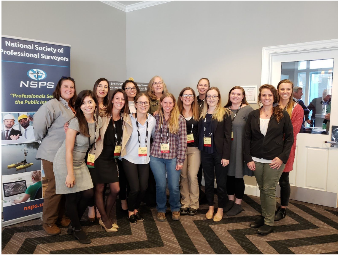
The women of the YSN!