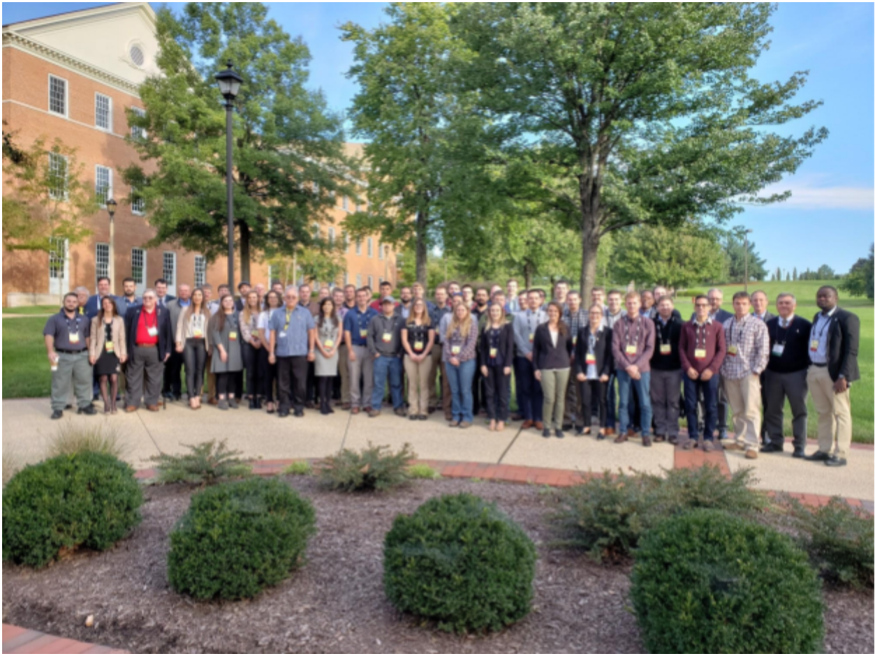
2018 FIG-NSPS YSN NA Meeting Attendees

Preparation for the meeting began in November 2018. The planning began with recruiting a planning team, organizing a location to store documents for collaboration, and identify tasks to be accomplished. Preparation took 12 months and was divided into various phases. Each phase is described below and includes planning, execution, and recommendations for future meetings.