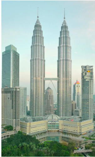
The impressive Petronas Twin Towers in Kuala Lumpur, Malaysia.

Please submit your full paper at: fig@fig.net