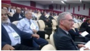
LADM audience listening focused

Over 40 participants attended the workshop and a total of 25 peer reviewed papers were presented, covering a range of themes, including: the industry perspective on LADM; the linkage between LADM and information infrastructures; refined LADM modeling, 3D representations and formalizing LADM semantics; specific LADM country profiles; and implementation aspects.