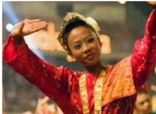
Experience the Malaysian culture at the social events

http://www.fig.net/fig2014/exhibition_opportunities.htm