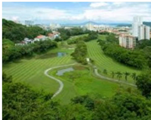
Join the Golf Tour after the Congress