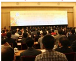
The 10th National Representative Assembly of CSGPC