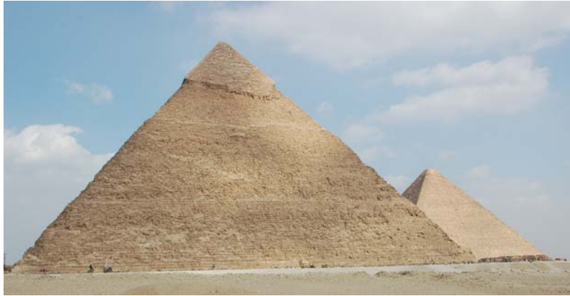
Fig.1 A view from Pyramids, Giza- Egypt

Today, the profession is facing many difficulties - even describing the exact role of the surveyor in a community. This has also brought forward issues such as providing a sufficient number of highly qualified professionals trained to higher education levels. A noticeable decrease in young people not only undertaking training as surveyors, but joining FIG has made this a global issue.