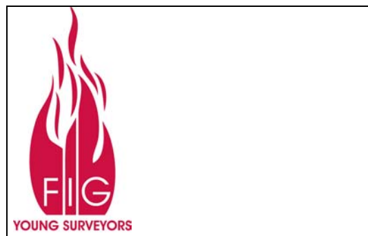
Fig.4 The FIG YS Logo designed by group members

Another step was creating a unique, recognisable logo for the group. It was decided that it should honour the FIG logo by maintaining the colours and general layout, but put a Young Surveyors spin on it. The result was the FIG Young Surveyors flame, seen below in Figure 4.