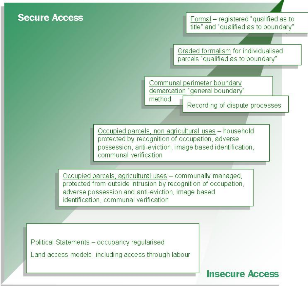
Figure 2, Scaling up occupation of rural poor in APR