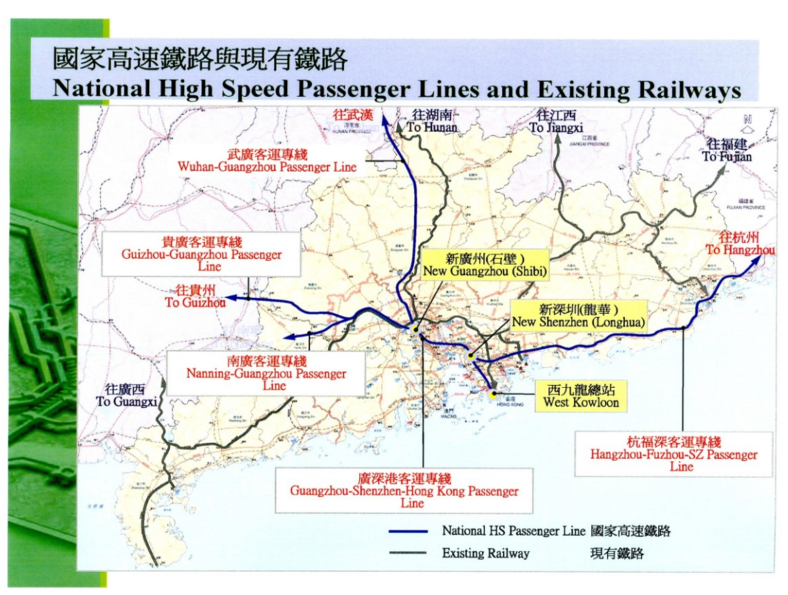
Fig. 1 (Extracted from Legislative Council Document CB(1) 166/09-10(01))

Upon completion, the HKSXRL will become part of the national rail network, connecting the Beijing-Guangzhou Passenger Line and Hangzhou-Fuzhou-Shenzhen Passenger Line. The travelling time between Hong Kong and the Central and Southern Mainland and various major Mainland cities will be greatly shortened as a result. For example, XRL passengers departing Hong Kong will take only four hours to arrive at Changsha, five hours to Wuhan, Xiamen and Fuzhou, and eight and ten hours to Shanghai and Beijing respectively. Through interchanging with the Pearl River Delta Rapid Transit System, the XRL will also connect Hong Kong with major cities of the Pearl River Delta.