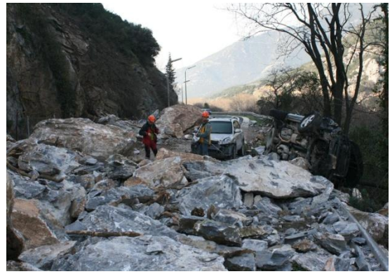
Figure 2. Tempi Valley rockfall 2009

As mentioned by Koukis et al. (2005), the landslide activity in Greece is increasingly high as a result of increased urbanization and development in hazardous areas, continued forest reduction and extreme meteorological events with serious socio-economic consequences.