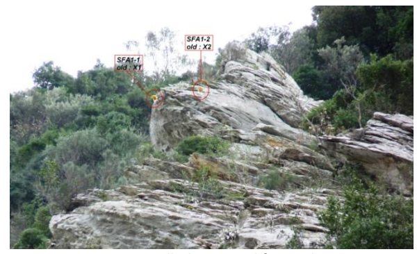
Figure 6. Prisms installed in special focused area SFA1.

Figures 6-8 of the installed geodetic network are presented below.