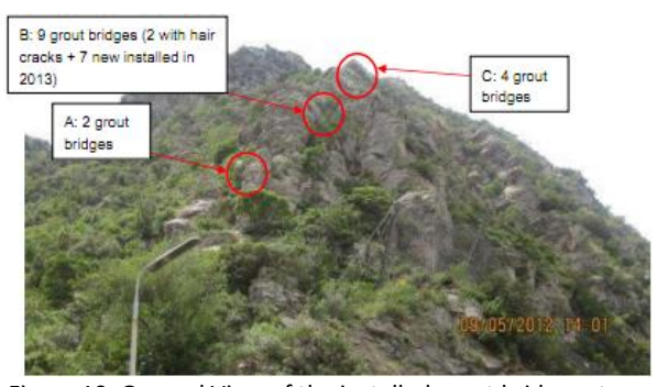
Figure 10. General View of the installed grout bridges at section 6 (old chainage 386+650).

Moreover to the geodetic monitoring network, another network consisting of grout bridges is applied to rock discontinuities where movement is supposed to occur prior to failure (figures 10 & 11). Cracks in the grout bridges would indicate movement. In total almost 100 grout bridges have already been installed in Tempi Valley in various locations.