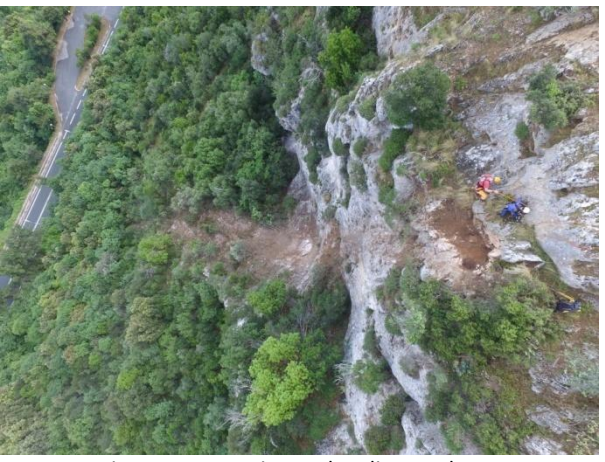
Figure 4. Inspection and scaling works

All parts of the barrier systems have to be controlled according to the maintenance manuals of the manufacturer. If parts of the system are damaged the diminution of the protection properties has to be evaluated and if necessary, immediate measures have to be taken. In case of damage to any of the rockfall protection measures, the damage report sheet has to be completed. In this sheet, damages to the rockfall protection are described, documented and classified with respect to the severity of the incident. The induced and finally completed measures are documented. Inspection and maintenance activities are presented in pictures 4& 5,