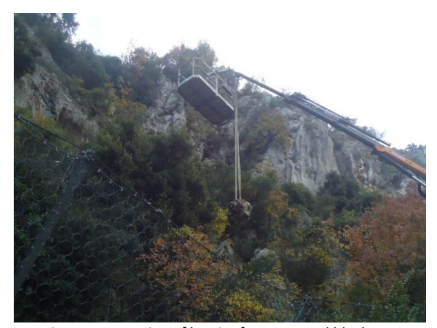
Figure 5. Emptying of barrier from trapped blocks