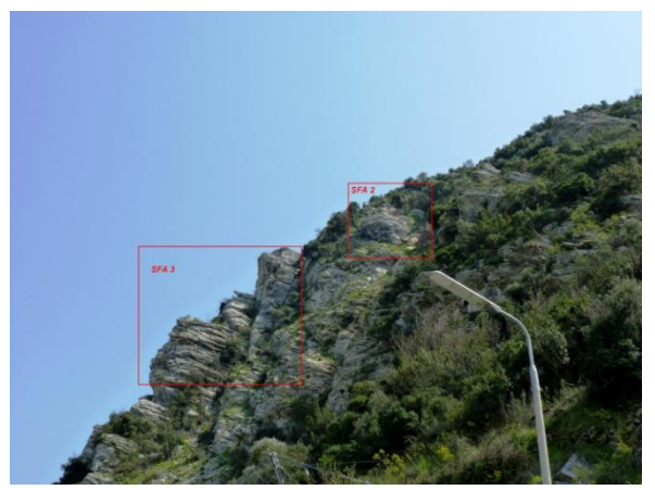
Figure 7. Special focused areas SFA2 & SFA3.