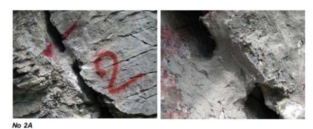
Installation Date: May 2012 (3nd bi-annual inspection by GEOTEST _ installation by Greek Alpinists)