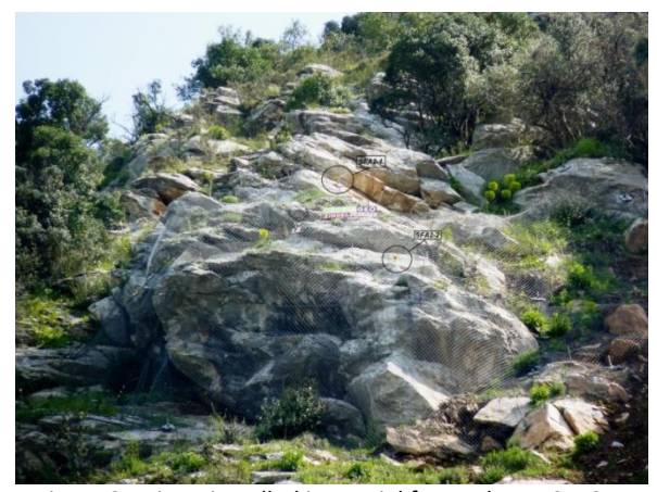
Figure 8. Prisms installed in special focused area SFA2.

Prisms are mainly installed in special focused areas (SFAs). Monitoring is performed at least once per month and always after an extraordinary situation like