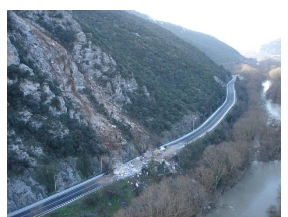
Figure 1. Tempi Valley rockfall 2009 by helicopter

Horio of Evritania region in 1963 that led to loss of 13 human lives and buried a whole village, the Panagopoula landslide in 1971, Tempi Valley rockfall in 2009 as presented in figure 1 & 2 that led to loss of a human life and the closure of the national road Athens – Thessaloniki for approximately 4 months, the Santorini rockfall in 2011 with one human loss, and many others.