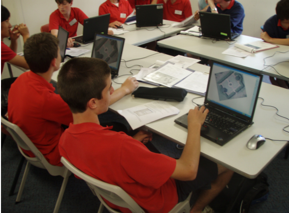
Figure 1 – Students at the Surveying Spectaculars are involved in field mapping followed by CAD drawing in the office. Encouraging and helpful supervision at all times ensures the students come away with a positive experience.

To date, attendance at a Surveying Spectacular has attracted 4 Survey Continuing Professional Development (CPD) points. 15 CPD points are required annually to maintain registration in NSW as a Surveyor. 1 CPD point represents 1 hour of professional development. Most