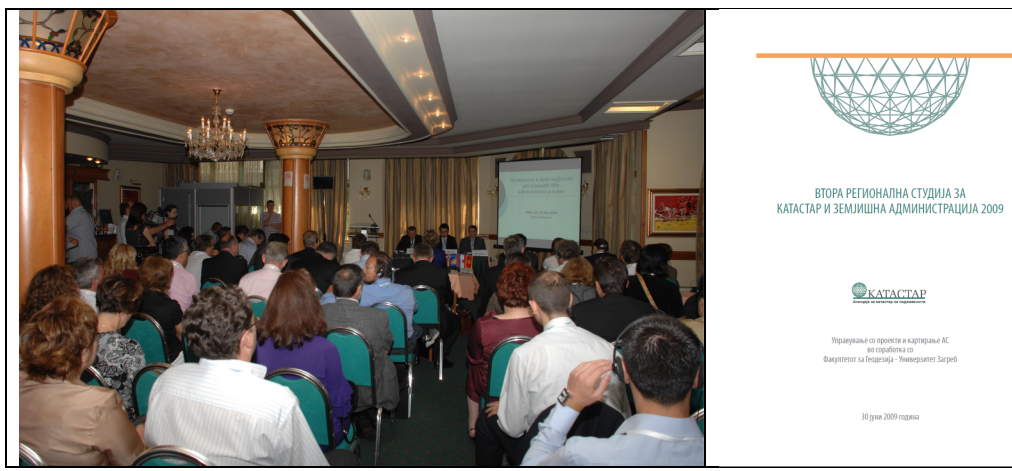
Figure 4: 2. Regional Conference on Cadastre, Ohrid 2009