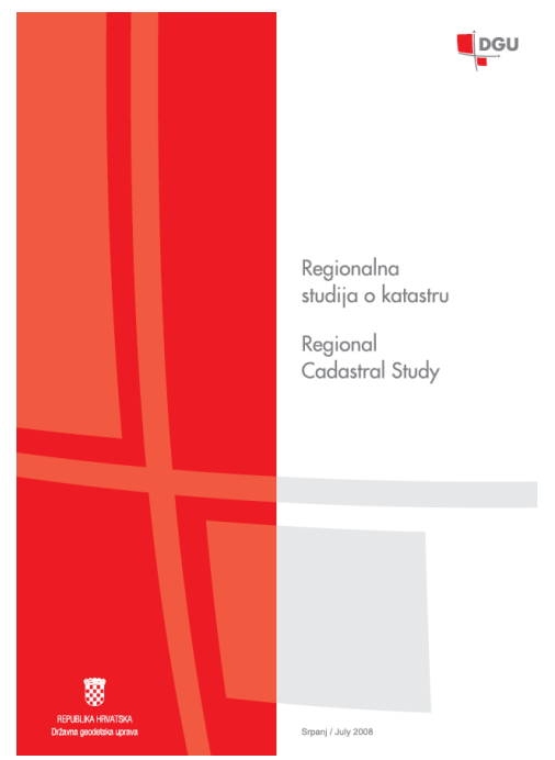
Figure 1: Cover page 1. Regional Study on Cadastre