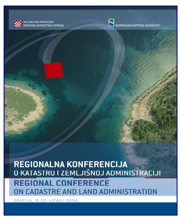
Figure 2: Poster of the First Regional Conference on Cadastre