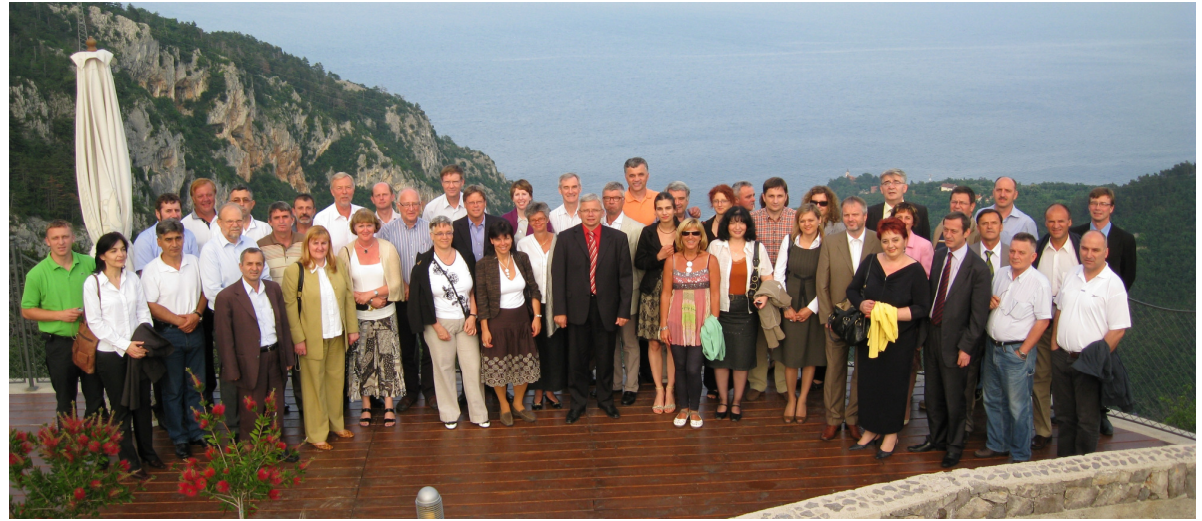
Figure 3: Participants of the First Regional Conference on Cadastre, Opatija, 2008

The Real-Estate Cadastre Agency of Macedonia organized the Second Conference between 25 and 27 May 2009 in Ohrid (Figure 4). Apart from cadastral issues, the emphasis of the Second Conference was already partially directed at the issues of the NSDI establishment and the organization of its establishment. Thus, the Second Regional Study on Cadastre was extended with a separate chapter on the condition of the SDI in the countries of