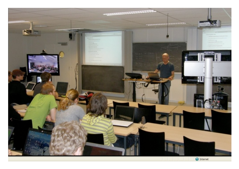
Real-time videoconferencing has functioned the last two years between two campuses at the surveying programme at Aalborg University, Denmark. The lesson learned points out, that it is necessary to learn the learners and involve the students in running the system.

During the second and third academic year courses are arranged for two year groups according to a common timetable. There is an almost complete synchronized timetable between the two groups.