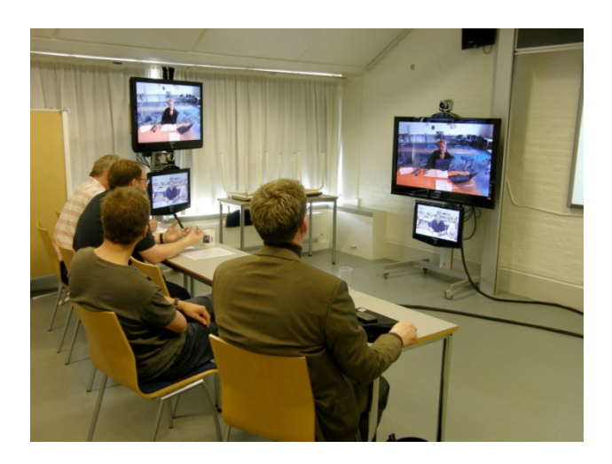
Using videoconference for cross-campus communication – like meetings, small workshops and similar - has been one of the very valuable spin-off effects of the strategy about using videoconferences for real-time-lecturing.

Most experience has been obtained from the meeting activities between the different departments. This experience is good, and it has turned out that in committee connections or in management teams where you are familiar with one another beforehand and with a community of values about the objective of the communication, video conferences become an excellent streamlining tool for communication and meetings.