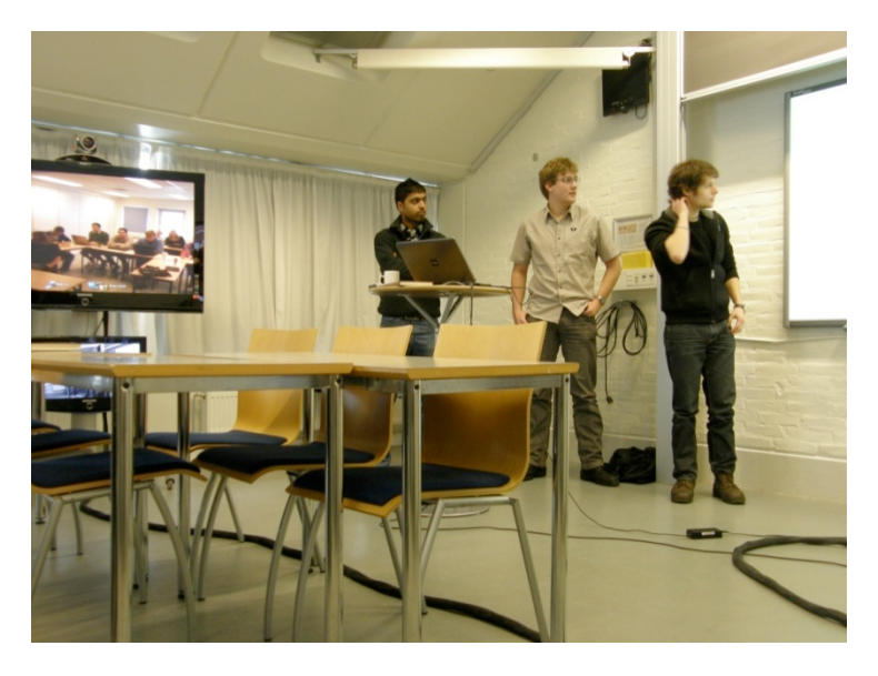
Successful implementation for the use of videoconference in real-time courses needs interaction with the students so they become active and act in practical use of the equipment and learn to act in these "screen environments". Being able to do this demands pedagogical innovation.

It might sound banal, men it is actually something which demands considerable getting used to it or learning when experienced lecturers from traditional auditoriums or seminar rooms have to take possession of the competence to perform facing two groups of students at the same time. It demands the lecturer's permanent attention to how he gesticulates, focuses and moves - in the literal sense of the word that he does not move out of the camera angle.