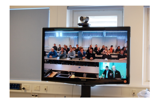
The video conference room with the Life Seize software for videoconference does not have the same quality and has only one camera and screen for every room. This limited quality sets a barrier to the flexibility and communication.

Experience has shown that this equipment has the same functionality as the PolyCom equipment concerning sound and picture quality. However, the consequence of only one camera in the set up is that a spontaneous debate between the audiences from two locations is more difficult. Experience has also shown that the Life Seize equipment is not as flexible as the PolyCom equipment concerning use for meetings and other communication activity.