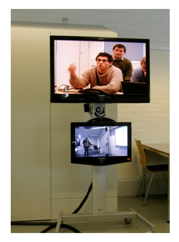
The system is flexible and gives great opportunities for face-to-face dialogue as a part of the pedagogical principles for running the courses.