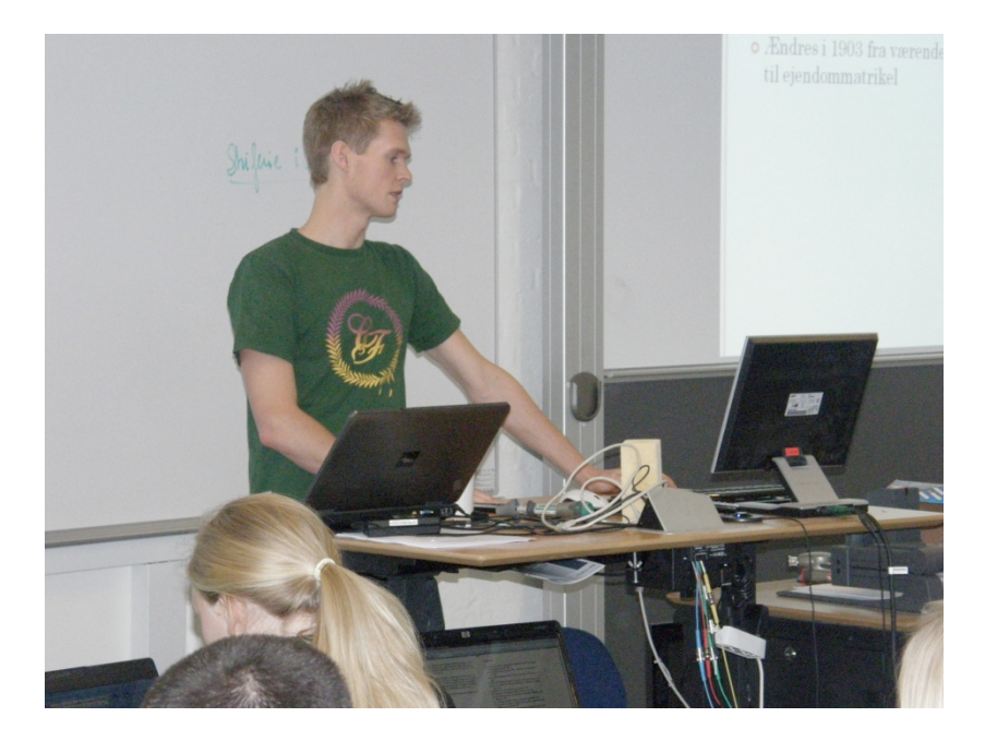
Today's students are very prepared for using modern information and communication technologies and they become very quickly experienced mastering technical and behavioural aspects of interacting with these screen-environments. Normally students are quicker to learn than the average lecturer.