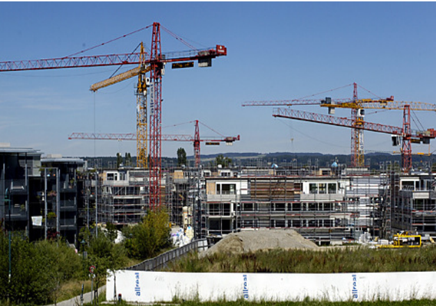
Fig. 2-1 Construction hype in Azerbaijan (2008, left) and Switzerland (2007, right).