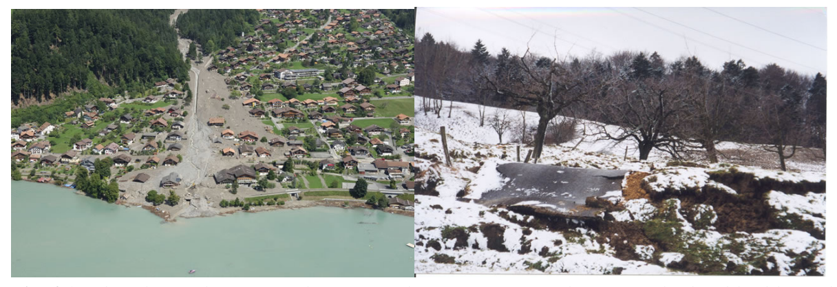
Fig. 4-1 Debris flow in the Bernese Alps, municipality of Brienz (2005, left), Switzerland and landslip in the eastern Jura Mountains, municipality of Wintersingen near Basel, Switzerland (1999, right).

Steering is successful especially if there is danger to be avoided by risk based land use planning measures. Hazardous areas as floodplains, mud and snow slide areas etc. are not feasible conditions for housing (Kohli, A. 1999). Even belated identification can be the reason