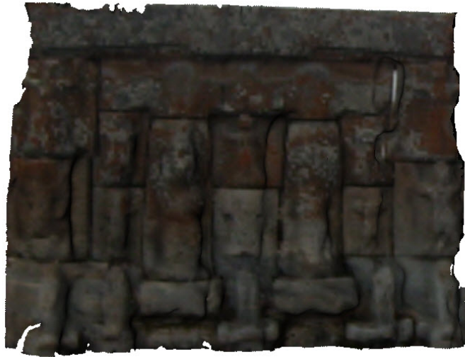
Figure 4. Close-up view of the photorealistic model