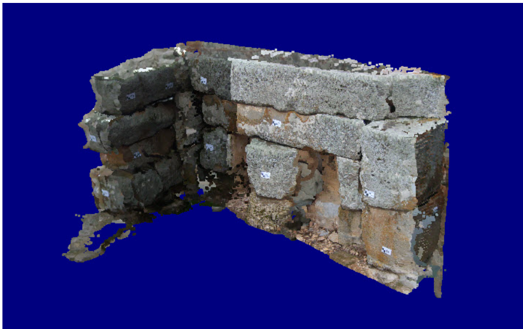
Figure 5. Point Cloud model of the North side of Eflatunpınar