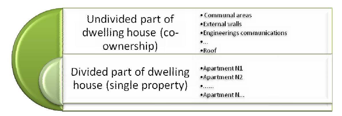
Fig.3 Parts of a dwelling house

dwelling house and of the land parcel on which the dwelling house was located, if it was not some other person's property. The size of joint ownership undivided shares was determined as the proportion of the size of the individual ownership to the total sum of the separate properties in the whole dwelling house.