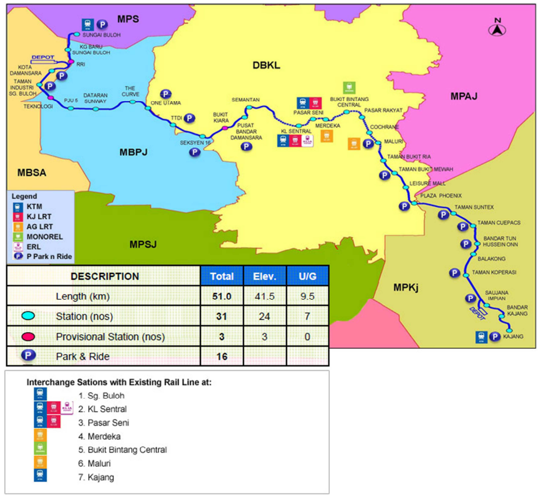
Figure 1: Proposed Klang Valley MRT Line

1.3 The boring of the underground tunnels will be made with several Tunnel Boring Machine (TBMs), one at each end of the sections. As of date of this writing, a Malaysian company has been awarded with the project to conduct the construction underground tunnelling portion of the SBK Line. This paper seek to describe the survey work which covered 9.5 km underground portion of the SBK Line, beginning from KL Sentral Station to Maluri Station, its philosophy and design, methodology of the surface geodetic control network and underground geodetic networks, field and office procedures for the precise transfer operations and extensive horizontal and vertical control into the underground facilities, and the control traverse scheme employed in the tunnels.