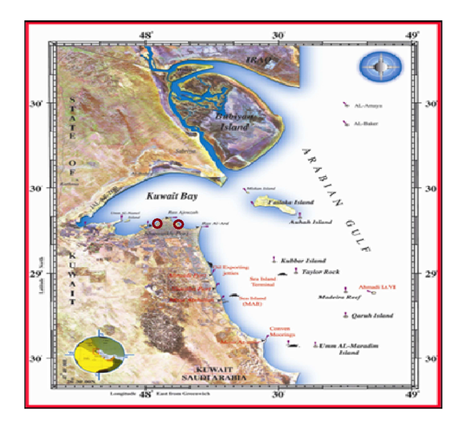
Figure 1: Geographical location of the State of Kuwait along with the two study sites of Green Island and Al-Shuwikh beaches (Red Circles)