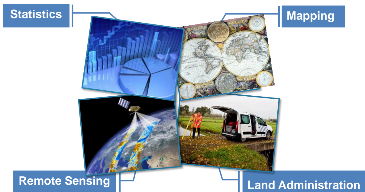
Figure 1. Professional worlds converge.

Looking at the trends in the arena of governmental organisations, academia and private sector, it becomes clear that professional worlds converge: Statistics, Geo-sciences, Remote Sensing and Land Administration experts come to together more and more in order to achieve challenging goals like the United Nations Sustainable Development Goals (SDG's).