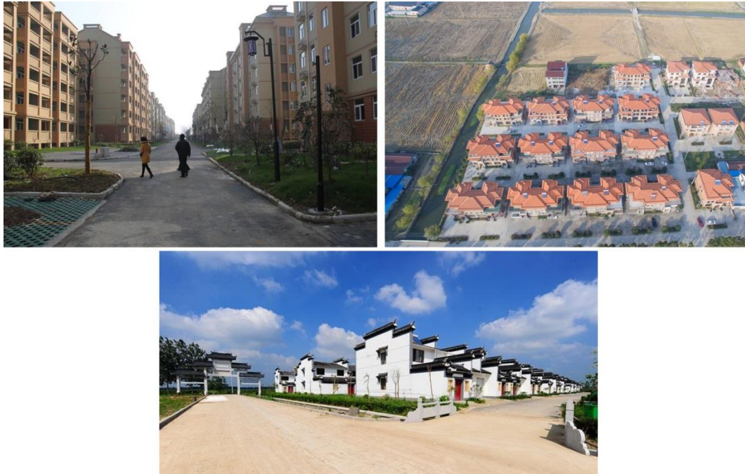
Fig.3 Village appearance Before Consolidation