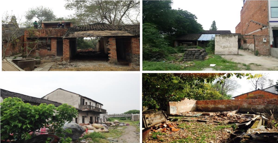
Fig.2 Village Appearance Before Consolidation

convenience of connecting with central city, the center villages have the certain advantages over other types of villages in the aspects of transportation, economy or industry, Therefore, the center villages also are considered to be the reserve regions for future expansion.