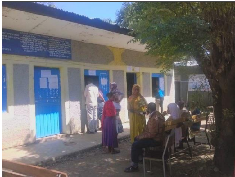
Landholders waiting at Fasilo Land Office, Bahir Dar

related file, as the numbering system may have been revised multiple times. Some of these registry books in the city archives were so old that they had become unreadable and were falling apart.