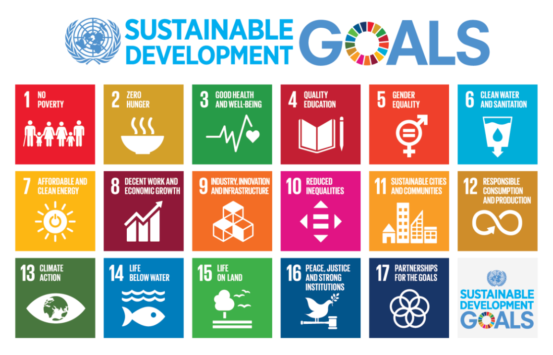
Figure 1. The 17 Sustainable Development Goals. © United Nations

Research undertaken by a range of key actors, including the World Bank, the Food and Agriculture Organization of the UN, OECD, civil society organizations, and academic institutions, shows that security of land tenure rights is closely connected with the realization of development objectives related to poverty alleviation, food security, environmental sustainability and enhancing women's empowerment. (Mennen, 2015)