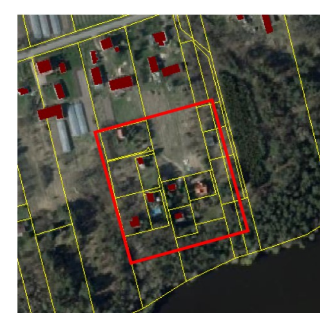
Fig. 4. Example of building plots without access to the public road in the Kikoły village, Pomiechówek commune