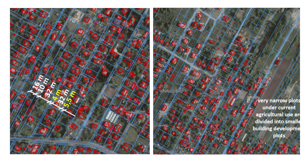
Fig. 1. City of Brwinów in the vicinity of Warsaw, new urbanised areas in the territory of the former Pszczelin village (widths of registered plots indicated in white, width of access roads – in yellow)