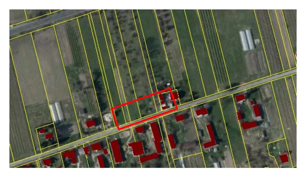
Fig. 6. Example of "gaps" in building development resulting from the failure to adjust plots to building development in the Kikoły village, Pomiechówek commune

4. Many "gaps" appear in building development. Very narrow plots remain not adjusted to building development (Fig. 6).