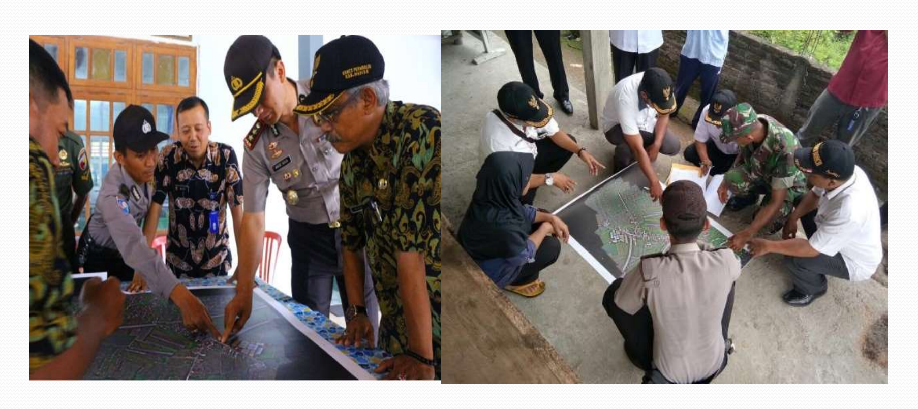
Figure : Participatory Approach in Ngampel Village for IP4T implementation