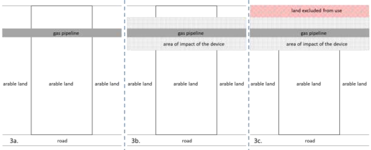
Fig. 3. Examples of a gas pipeline running through the property with possible limitations.

Re. 5. Finally, the factor considerably affecting rational land use is the course of the device running through the property. The criteria discussed earlier remain important of course, namely the type of device, its occurrence towards ground surface, technical parameters, and area of impact of the object. It is the course of the device, however, that can determine whether, in an extreme case, additional land (outside of the area of impact of the object) will be excluded from current land use (Fig 3c).