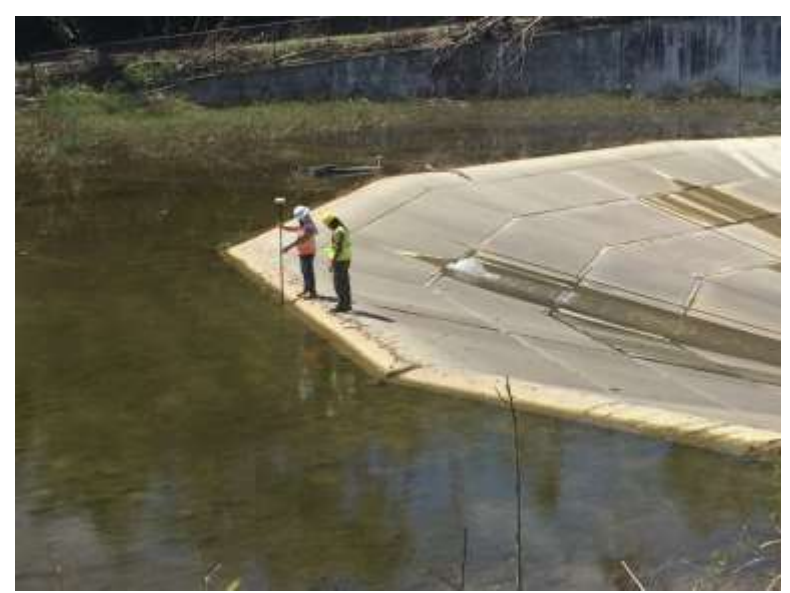
Figure 10. Land Surveyors perform As-built Survey applying Real-Time Kinematic (RTK) techniques at Guajataca Dam after hurricane Maria. (Seda, 2017)

Topographic and As-built surveys were finished in a period of 2 weeks. Additional work was requested once the urgent surveys were finished. The next phase of the project is to map the existing conditions of the diversion and irrigation channels from the Guajataca dam to Isabela, Moca and Aguadilla (approximately 35 linear miles of canals). This survey is scheduled to be completed soon. Currently being carried out in the project is the stakeout of drill holes for soil testing and Soil Nails to hold the existing spillway and the redefinition of the 54 "siphon pipe that will connect the bypass channel with the dam.