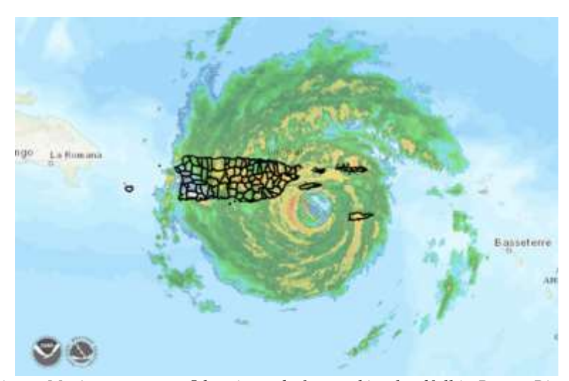
Figure 1. Hurricane Maria, a category 5 hurricane before making landfall in Puerto Rico. (NOAA, 2017)

At 6:15 a.m. on September 20, 2017, Maria made landfall in Yabucoa, Puerto Rico as a devastating category 4 hurricane with maximum sustained winds of 155 mph. Up to 40 inches of rain was reported. After 12 hours of catastrophic force over Puerto Rico, hurricane Maria was gone, and time stood still for too long.