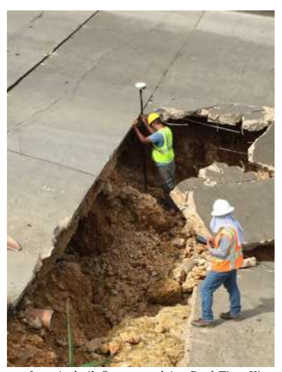
Figure 8. Land Surveyors perform As-built Survey applying Real-Time Kinematic (RTK) techniques at Guajataca Dam after hurricane Maria. (Seda, 2017)

When Land Surveyors arrived at the site, there was no internet connection and therefore no access to a Virtual Reference Station (VRS), which operates using a network of reference stations and sends data through a wireless connection. In substitution, a local control network using Real-Time Kinematic (RTK) techniques with approximate locations in order to create a control polygon and begin survey work.