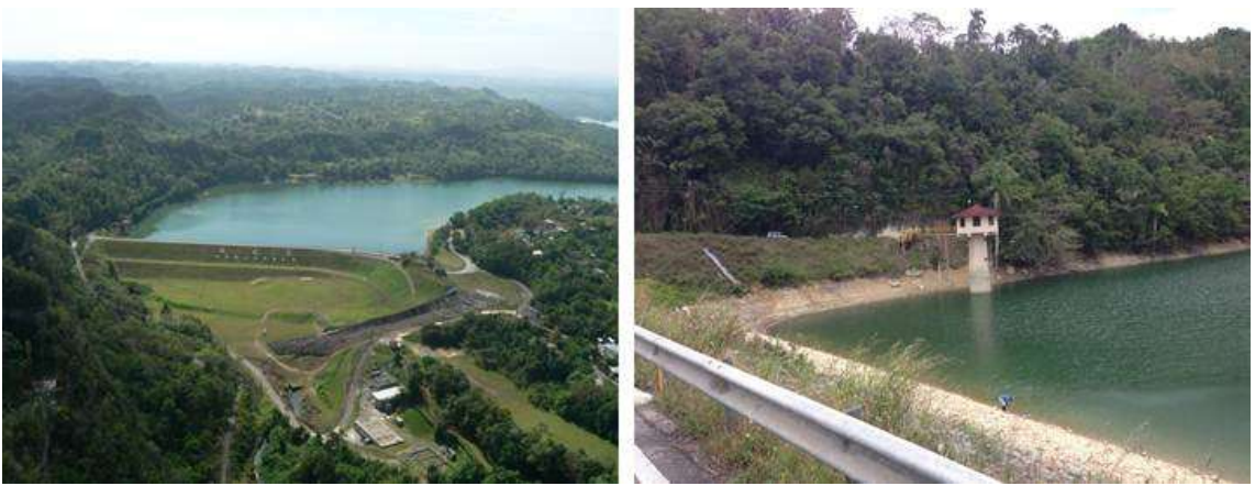
Figure 3. Aerial photos courtesy of Puerto Rico Energy and Power Authority (PREPA).

water supply. This 120-foot wall dam is one of 38 dams in Puerto Rico and is considered a high hazard potential structure.