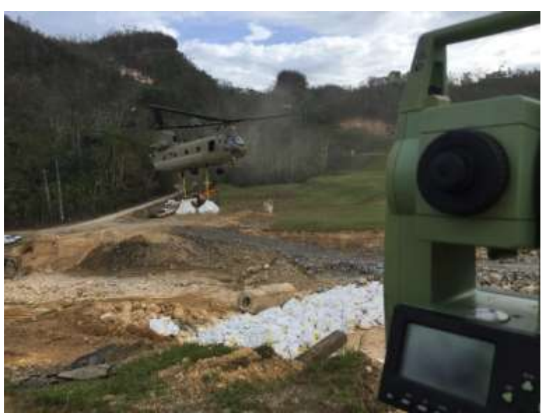
Figure 7. US Army Corps of Engineers' personnel collaborating in the mitigation efforts at Guajataca Dam after hurricane Maria. (Seda, 2017)

As soon as the Puerto Rico Power Authority acknowledge the damage, mitigation efforts began to avoid the erosion of the land in the western part of the dam. With help from the US Army Corps of Engineers' personnel, New Jersey-type concrete barriers and sandbags were arranged in the lower part of the spillway, creating a dissipator in which the levels of the lake were lowered, and flow was completely controlled. Rip rap and gabion stone were also deposited on the entire surface.