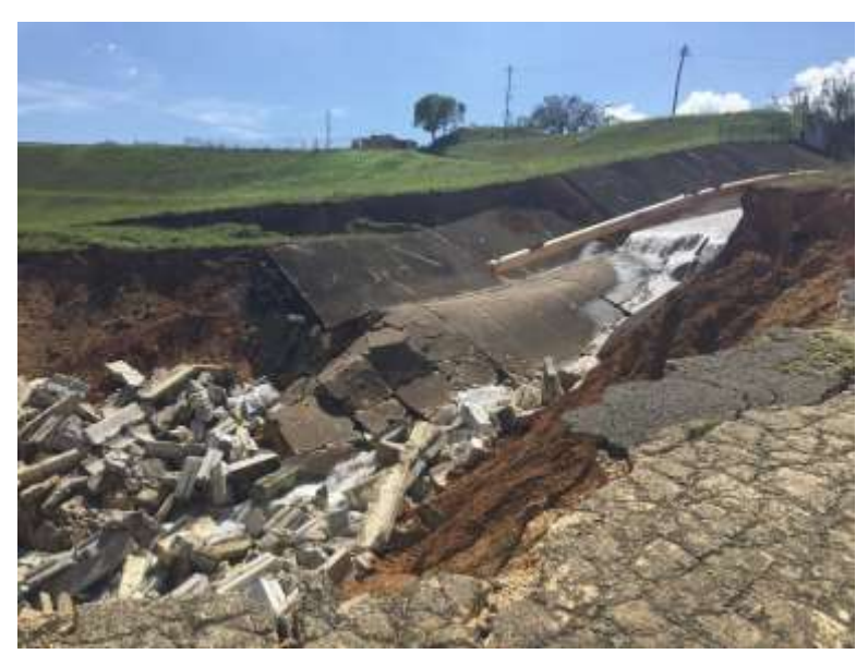
Figure 4. Erosion at base of dam. (Seda, 2017)

Another damage caused by this catastrophic storm was the collapse of a 54" reduced to 48" concrete pipe siphon, which fed the diversion channel that carries the water to municipalities served by the dam.