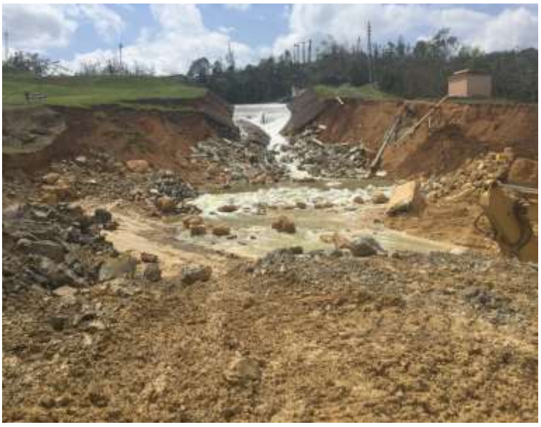
Figure 5. Erosion at base of dam. (Seda, 2017)

Another damage caused by this catastrophic storm was the collapse of a 54" reduced to 48" concrete pipe siphon, which fed the diversion channel that carries the water to municipalities served by the dam.