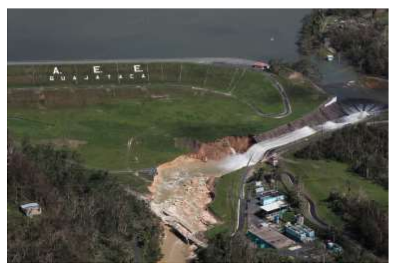
Figure 6. Aerial view showing the damage to the Guajataca Dam in the aftermath of Hurricane Maria.