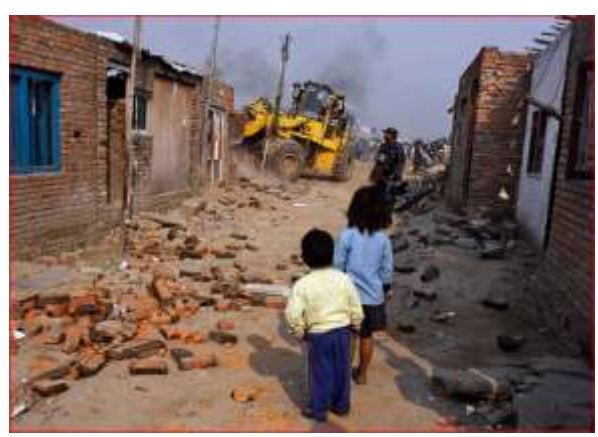
Figure 2 Thapathali Sukumbasi Area being demolished by Nepal Government