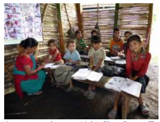
Figure 3 Classroom after Nepal Earthquake (left), children studying in temporary classroom (right).

Development of Fit-For-Purpose Land Administration Country Strategy: Experience from Nepal (UN-HABITAT GLTN) (10049)