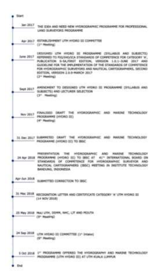
Figure 2: UTM HYDRO III's establishment phases