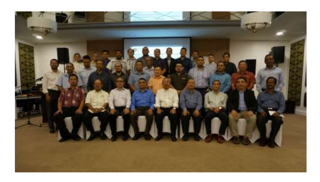
Figure 5: Opening Ceremony of UTM HYDRO III

The first Hydrography and Marine Technology Programme (UTM HYDRO III) started from 5 October 2018 and will ends on 4 August 2019. The Opening Ceremony was officiated by the Director General of Department of Survey and Mapping Malaysia (Figure 5). The UTM HYDRO III is attended by a total of 18 Malaysian Professional Land Surveyors as shown in Figure 6. The programme was delivered on modular approach at UTM Kuala Lumpur, Malaysia.