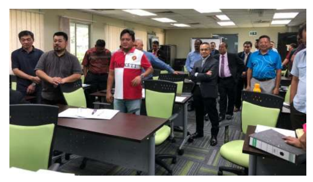
Figure 6: Students in the Classroom UTM HYDRO III