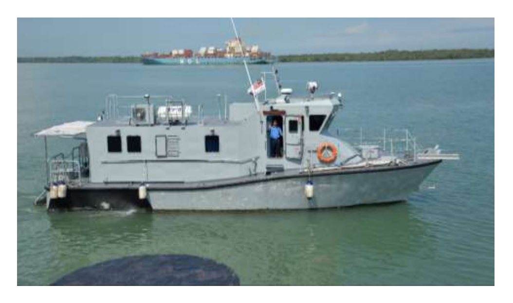
Figure 4 : Hydrography Survey Vessel (NHC)

The main aim of Hydrographic Field Survey Project is to expose the students with experience by combining the material covered in the previous modules and to supply the hands-on experience with field equipment which is not available in the classroom. In this field project, a comprehensive survey operation starting from survey planning which includes collecting data from the existing records, establishing survey control, and hydrographic data acquisition, up to the completion of the field sheet in the form suitable to be submitted to the field sheet checking unit. Apart from manual entry, the students will also be exposed to the use of hydrographic softwares i.e. real-time data acquisition system and post-processing software. All these are covered in chronological order and each Malaysian Professional Land Surveyors works on every aspect of the survey. The Hydrographic Field Survey Project will be conducted with multibeam survey and other related hydrographic sensors.