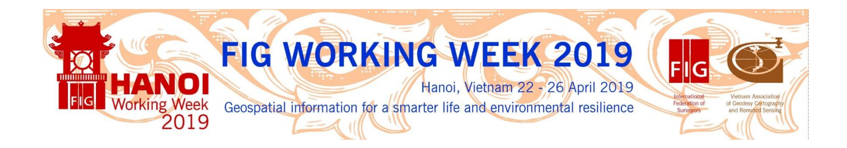
FIG and Affiliate Members – how to create a win-win model in a global community?