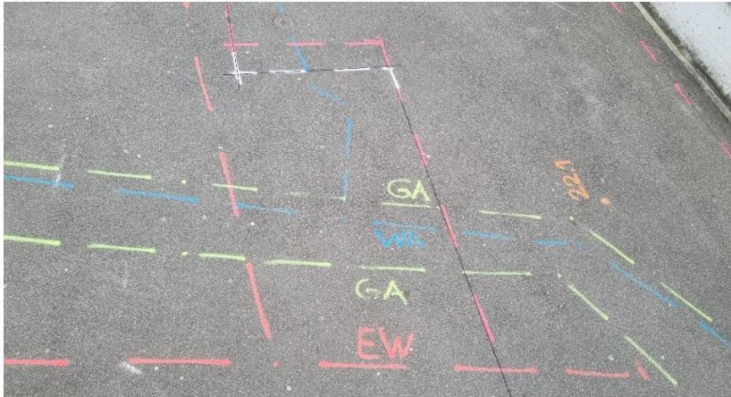
Figure 1 Visualisation of the utility conduits and pipes for excavation work based on the underground cadastre (coloured by asset type)

This means that the latest data from all asset owners is available when planning conduits. The data can also be used for excavation during regular construction work as well as when uncovering a section in an emergency case (e.g., in the event of a burst water pipe), meaning that very little manual labour is required to locate conduits and pipes before starting the on-site work (see also Figure 1).