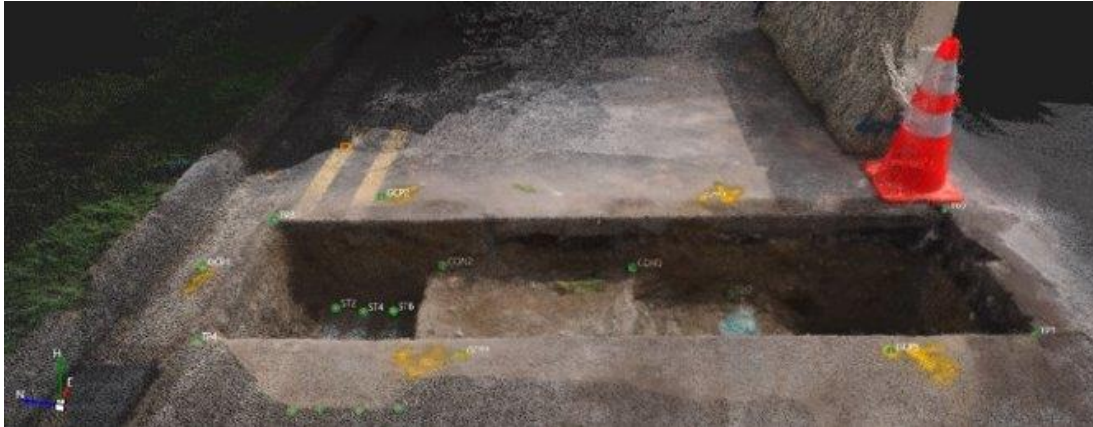
Figure 3 Coloured point cloud of a trial trench