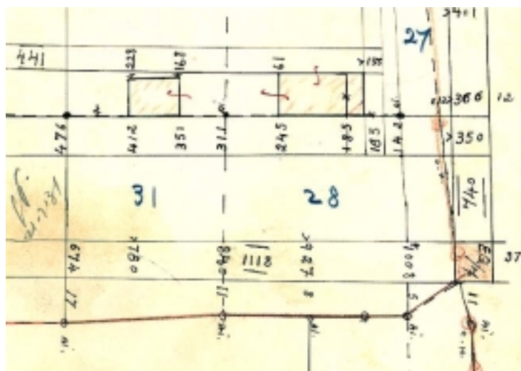
Figure 1. Typical Field Book Page

Cadastral mapping is the method of registering land, designed to ensure the rights of individuals and the state of their property. In Palestine (preceding the state of Israel) registration of land (as Registration of Deeds) began in 1867, when the country was under Ottoman Empire rule. Modern cadastral mapping started in Israel in 1926, based on the Torrence principles - Registration of Titles - the most advanced and innovative system at the time (Dale, 1976). This system defines the cadastral blocks and parcels based on official surveying and mapping that is carried out (in Israel) by the state and linked to the national coordinate network. Measurement results are recorded in field books and used to determine the boundaries of the blocks and the parcels, as well as other features (buildings, fences, electric poles, etc.). A typical sample of a field book page is depicted in Figure 1. All these measurements are depicted graphically on field plan sheets. Maps of the cadastral blocks are prepared based on the field sheet (see Figure 2), consisting of all parcels in the block and all included features. These cadastral maps contain neither the measured data nor any dimensions whatsoever of the parcel boundaries and serve only as a graphic presentation of parcel layout.