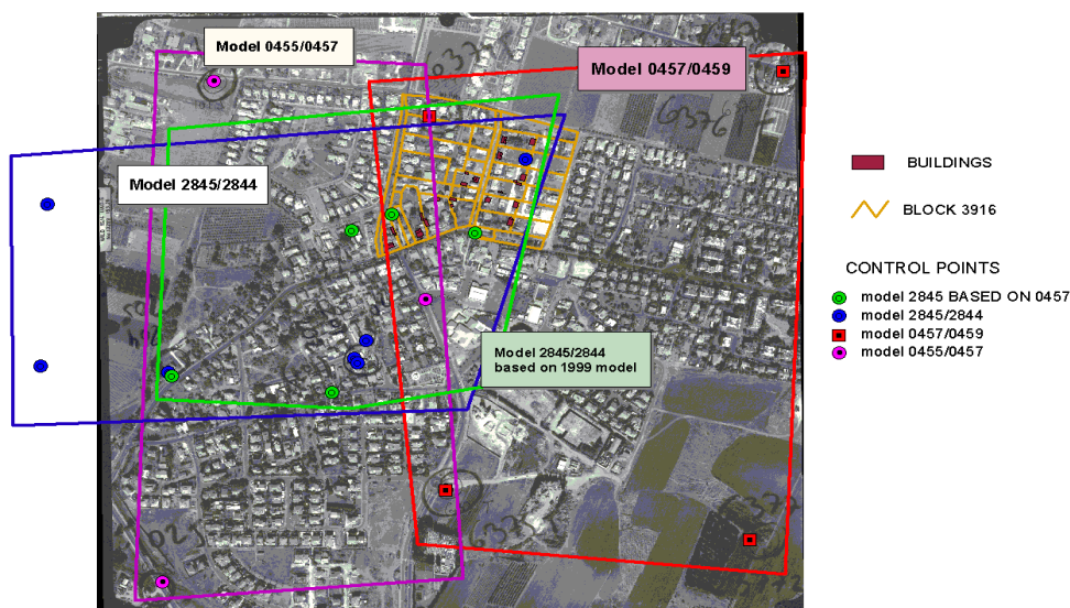
Figure 3. Layout of Aerial Photogrammetric Models

Based on the fact that the current field reality is totally different from the photogrammetric reality as depicted in the previous aerial photographs, it was suggested that a two-step photogrammetric solution process be applied: 1) the photogrammetric models of updated aerial photographs will be solved based on GPS measured control points, and then, 2) based on control points measured from the recent photographs and transferred to the previous aerial photographs, the previous photogrammetric models will be solved.