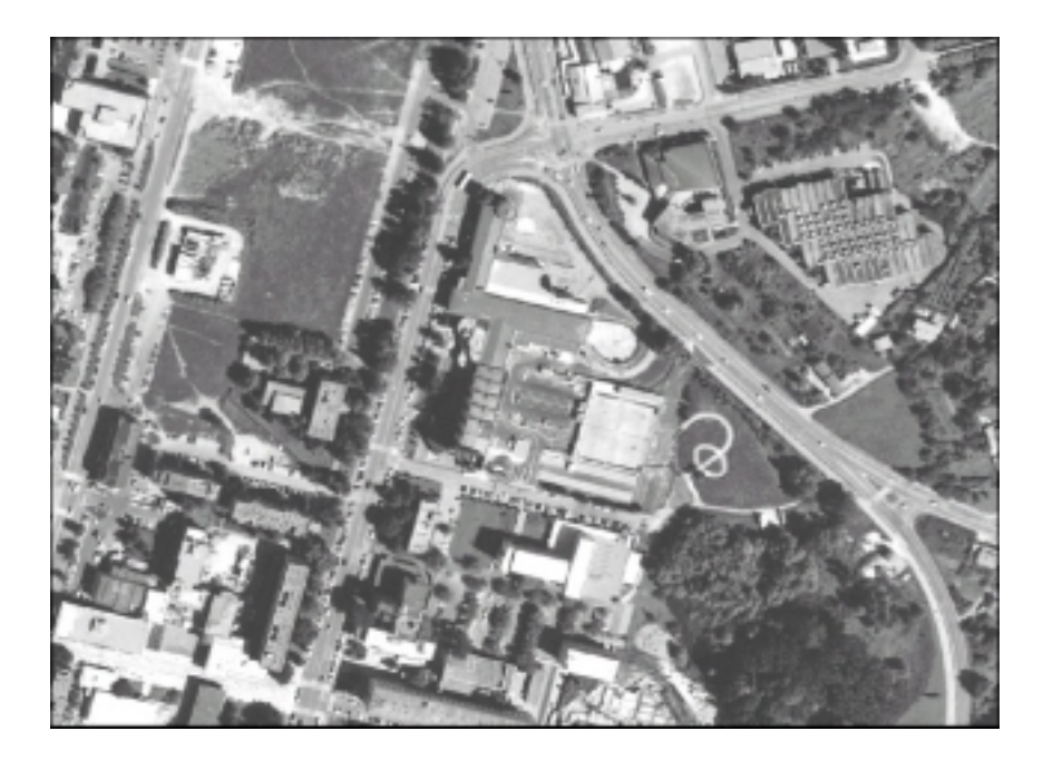
Figure 1: Digital ortophoto map